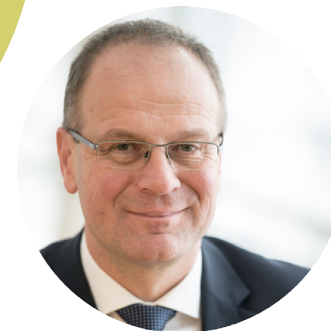
Tibor Navracsics European Commissioner for Education, Culture, Youth and Sport