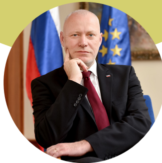
Milan Brglez President of the National Assembly of the Republic of Slovenia

Dr. Milan Brglez was born in Celje in 1967. After completing primary and grammar school, he enrolled at the Faculty of Social Sciences, Political Sciences and Journalism where in 1992 he majored in political science/international relations, completing his studies with the faculty's Prešeren Award. After graduation, he enrolled at the Faculty of Law at the University of Ljubljana and in 1996 defended his master's thesis on the codification of contemporary diplomatic law for which he received the Zore Award. In 2006 he received the best PhD thesis award of the Faculty of Social Sciences for his doctoral dissertation on the theory and philosophy of international relations research.