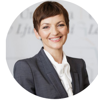
Maja Makovec Brenčič Minister of Education, Science and Sport of the Republic of Slovenia